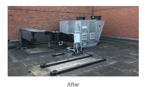
Sep 02 Sep 09